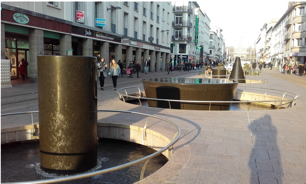
Marta Pan 's fountains in Siam street in Brest.

These artists have chosen abstraction to express this « elsewhere » that they were seeking in their art and in their lives.