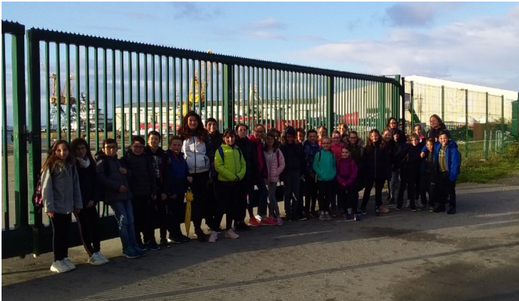
Brest's shipping port

Then they observed the modes of transport used in Brest because they study city transports in Geography.