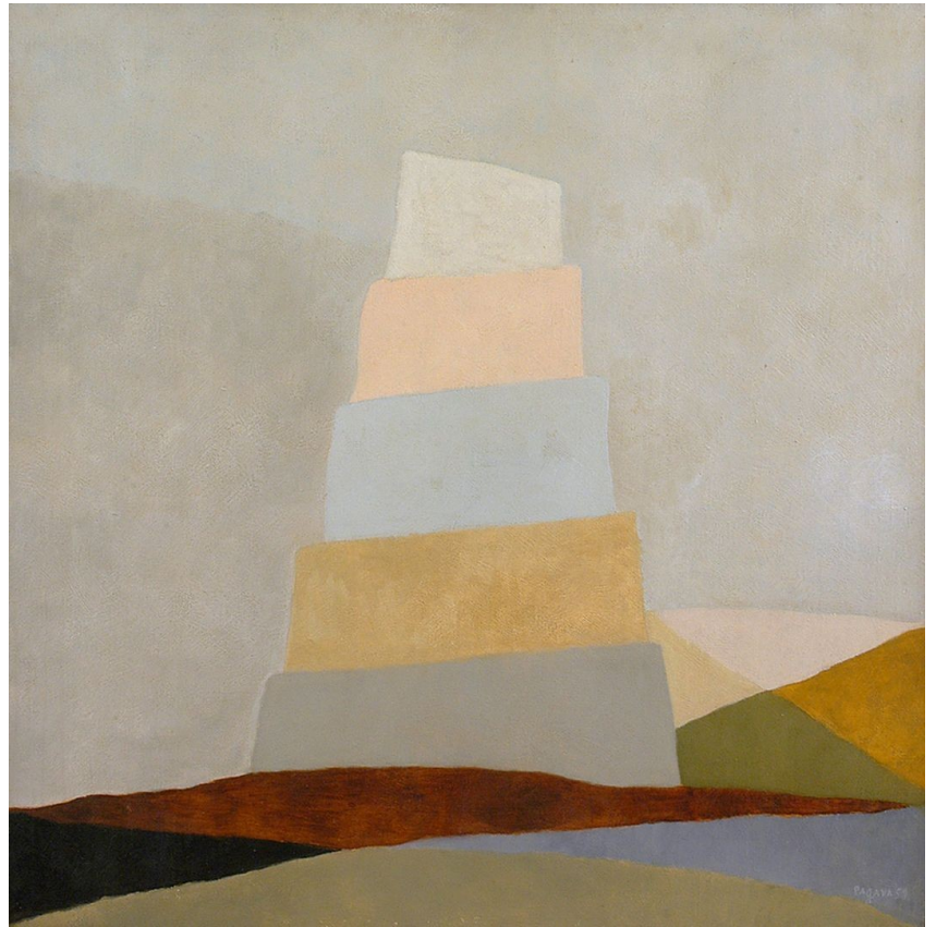
« Tour de Babel, Vera Pagava, 1959 »

Workshop in the museum about Vera Pagava 'Babel tower »