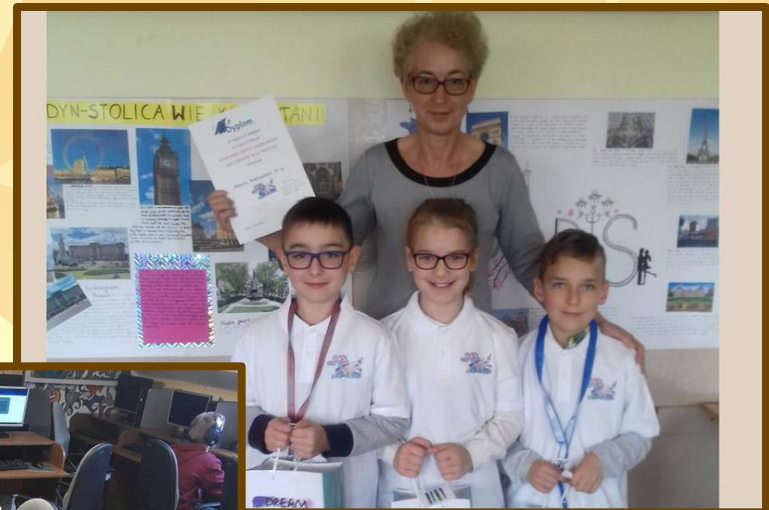
English language contest